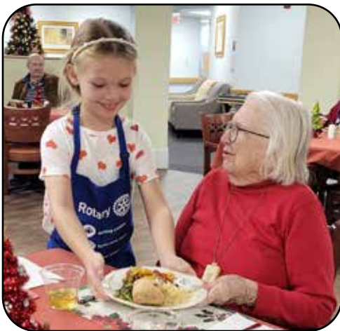
Below left: Rotary volunteers served dinner to residents at Dacier; Below center: Oktoberfest fun