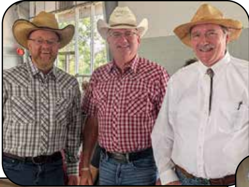
Left: It was a boot-stompin' good time at our Hoedown! Right: Our Masquerade Party was a big hit. Below left: Re-living the Roaring Twenties party; Below center: Sock Hop Dance brought back memories