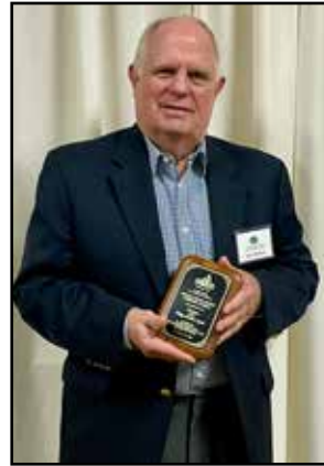
Dulins Grove Advent Christian Church, Associate