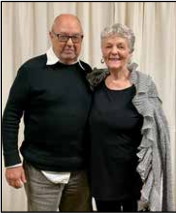
John & Sharon Germaine Associates