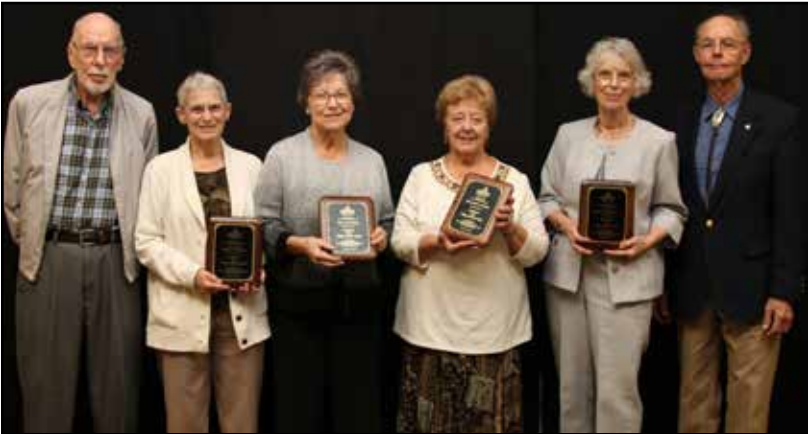
Left: Claiborne Advent Christian Church Associate