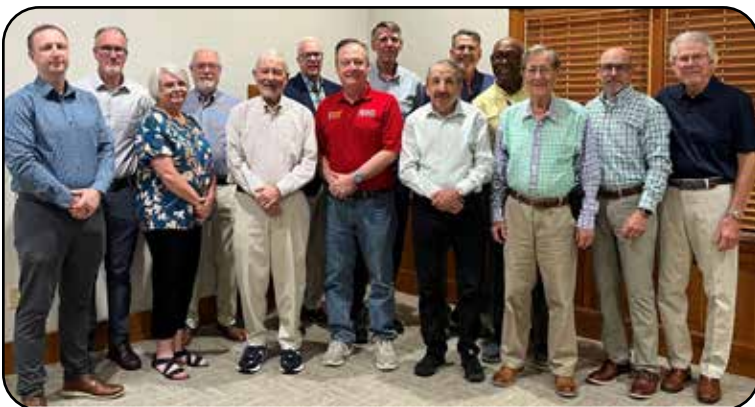
ACV Board of Directors at their May 2026 meeting